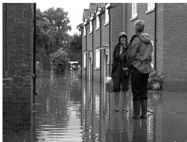
The flooding in the centre of Alcester in 2007

The Environment Agency fact sheet also stated that the flooding was mainly caused by surface water collecting behind the flood defences which was also incorrect.