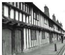
Nash's House New Place