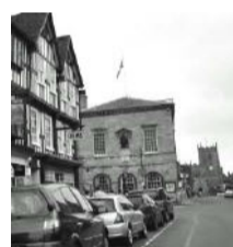
Harvard House The Garrick