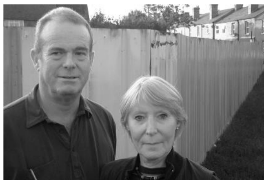
Above: the new fence has proved unpopular with residents.